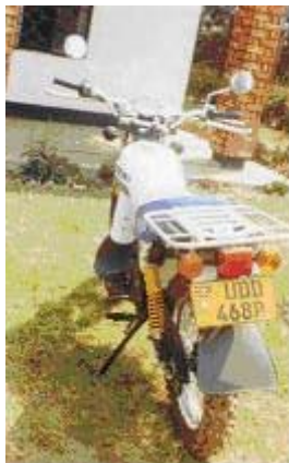
Motorbike for the Field Extension Worker

This is a continuing need. The centre in Kabale desperately needs a motor vehicle for transport of students and goods at the vocational training college. An opportunity exists here for restricted donations to meet this need.