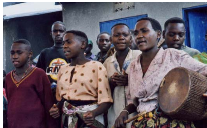
Photo of the Batwa musicians

This is a major achievement and ongoing aim for AICM in Uganda. They have recently written a comprehensive history and development programme for the Batwa which has been presented to the president's office and to various organisations in an endeavour to raise further support. There is an accompanying video which we now have. Copies of the programme and the video can be made available for anyone wishing to find out more. There is an urgent need for more funding and support in order to maintain and develop the Batwa programme if these people are to be properly recognised, integrated and provided for.